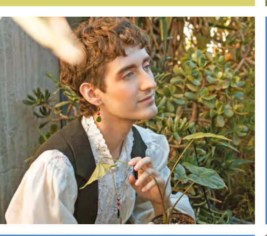
"Teens often come to Aviva with complex needs. When they leave feeling more capable, with more tools and skills to navigate their world – that's a big win." RANGATAHI KAIMAHI