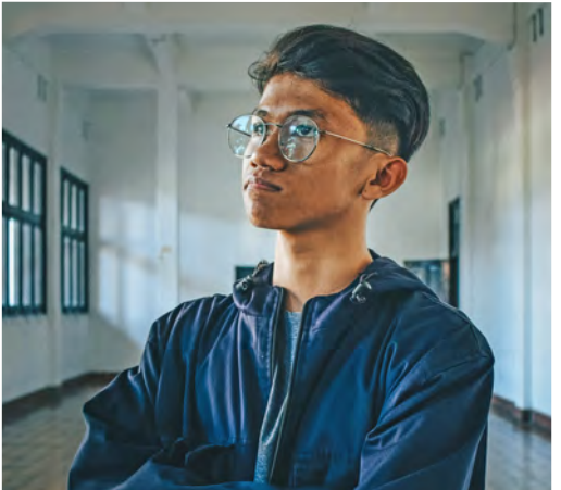
"Consent is about mutuality and what each person wants to happen. It's not just a tick box of yes or no, it's a joining together of one another's wants, needs and desires." SEXUAL VIOLENCE KAIMAHI