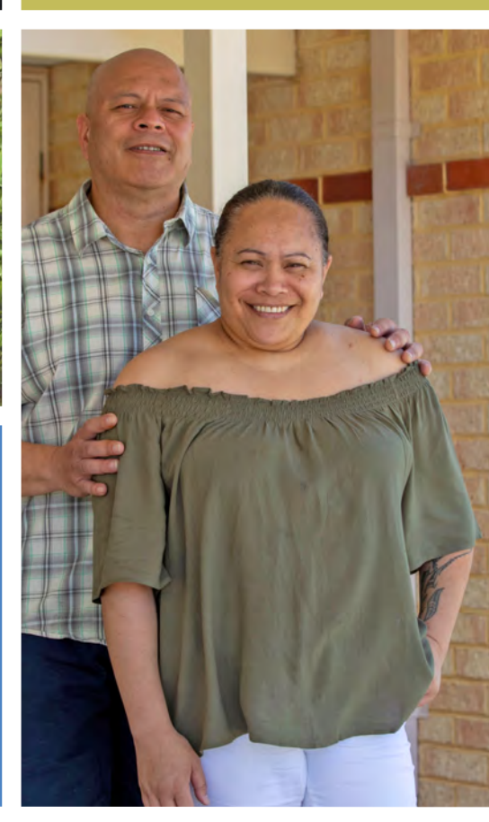
"My advice to anyone going through family violence of any sort is – don't be ashamed, it's not your fault, and you're not alone." FAMILY VIOLENCE WHAI ORA