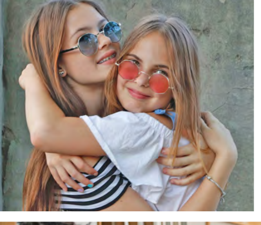
"...their GP and I can see a change in the way they articulate their feelings. They're more confident, comfortable kids. Thank you." HEALTH IMPROVEMENT